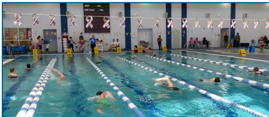
The Swim-a-Thon, which attracted more participation than in the previous year, raised about $4,000 on behalf of Autism New Jersey, the state's leading resource for Autism.

Contributions from AmSan, Ferguson Plumbing and VanCon School Bus Builders also contributed to the total funds raised. •