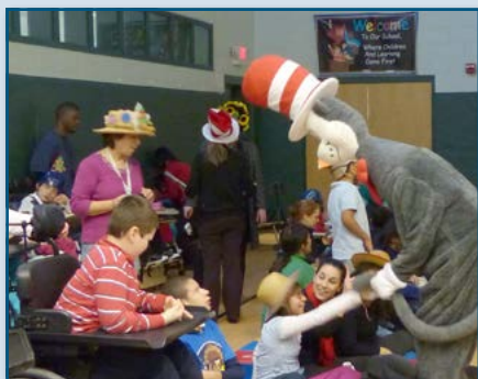
The NJEA's Cat In The Hat visits BBLC.