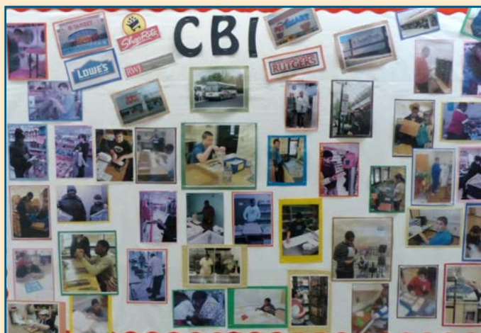
Academy Learning Center students created a bulletin board showcasing the numerous job sites and community partners involved in the school's Community-Based Instruction program.