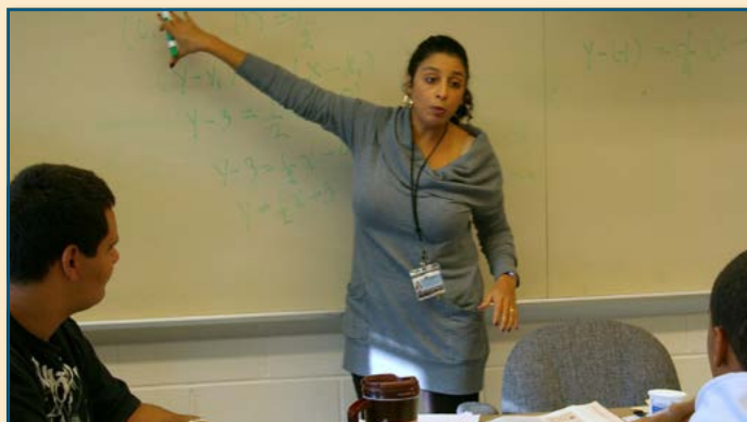
Based on input from constituents, the Interim Alternative Educational Program is changing its hours to 8:45 a.m. – 2:15 p.m.