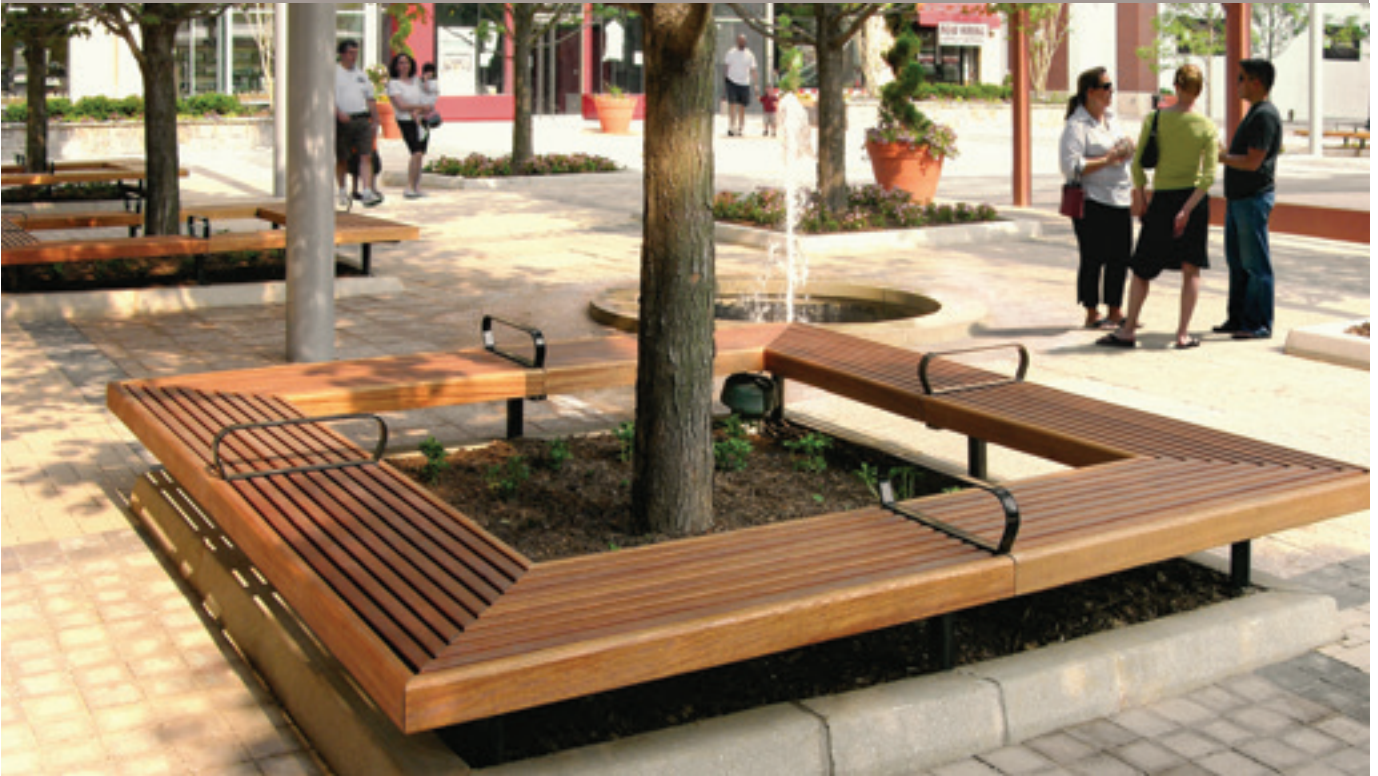
Rockville, Maryland, USA.*