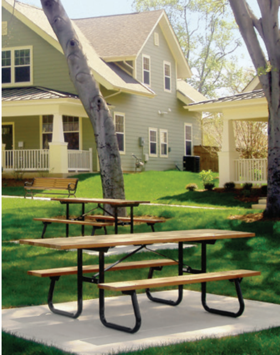
ST-5. Wood slats. Fort Belvoir, Virginia, USA.*