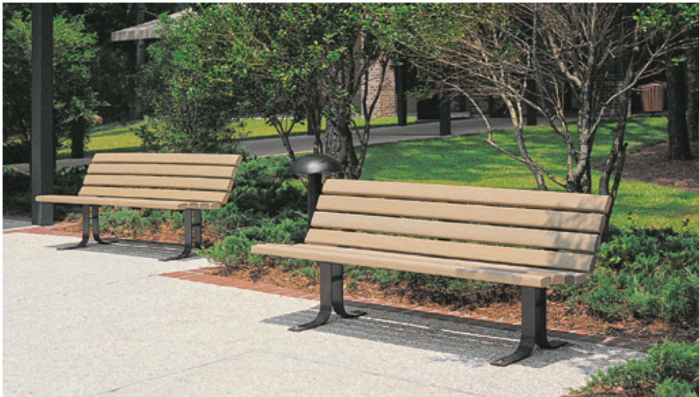
Model 8. 2nd Site Systems® recycled plastic slats. Gull-wing mount.