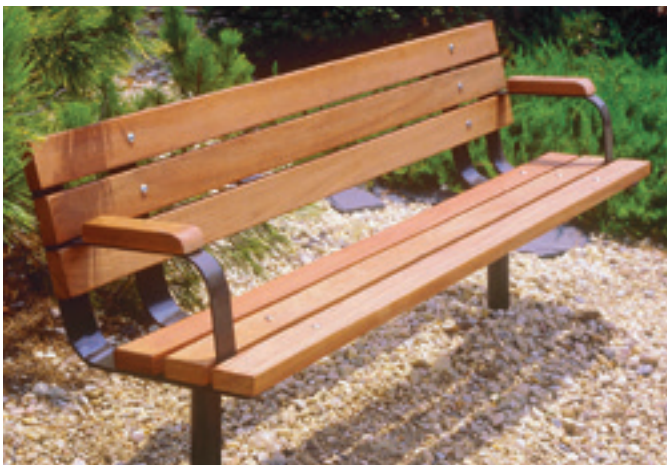
Model 2. Optional armrests.*