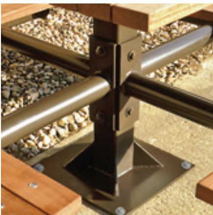
Center-Post Table Components. Optional surface mount.

OPTIONS: Surface mount. In-ground mount. Wood slats. 2nd Site Systems® recycled plastic slats. Gameboard.