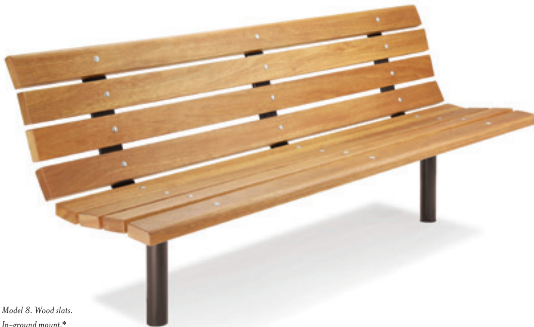
Model 8. Wood slats. In-ground mount.*

A broad collection of benches and a complete choice of tables. Homestead products feature sturdy construction, all-welded steel frames, carefully chosen and finished wood slats in several thicknesses, and choice of mounting options.