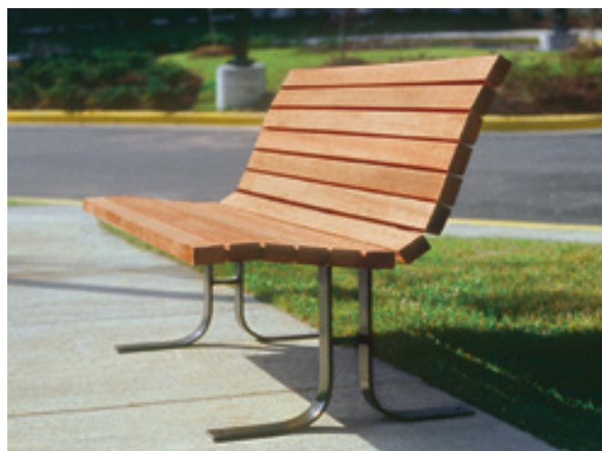
Model 32. Optional gull-wing mount.*