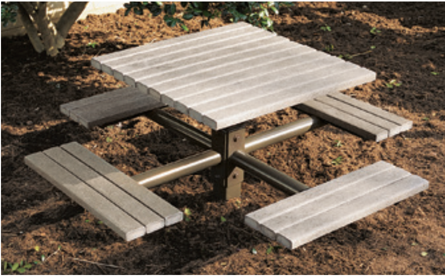
CP-4. 2nd Site Systems® recycled plastic slats.