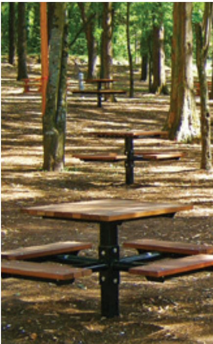
CP-4. Wood slats.*

Heavy steel angle supports act as integral frame for entire table top and seat support. Entire steel tabletop frame is welded to assure rigidity.