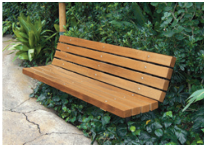
Model 28. In-ground mount.*