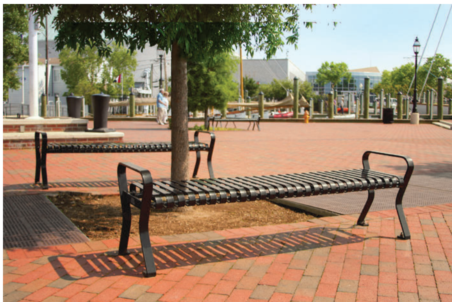
RB-12. Annapolis, Maryland, USA.

4, 6 or 8 ft (1.2, 1.8 or 2.4 m) length. Steel scrolls. Surface mount tabs. 8 ft (2.4 m) length includes center leg. OPTIONS: Intermediate armrests. Center leg with armrest for 8 ft (2.4 m) length.