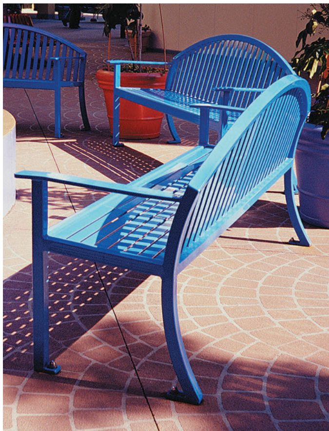
RMFC-24. Nagashima, Japan.

OPTIONS: Dome lid (ashtrays available). Convex lid (self-close door available). Rain bonnet lid (ashtrays available). Recycle lids (pages 105, 108). Half-Moon liners for RB-36, RB-45. Galvanized steel liner for RB-24, RB-36 (powder coat available). Custom decals and plaques.