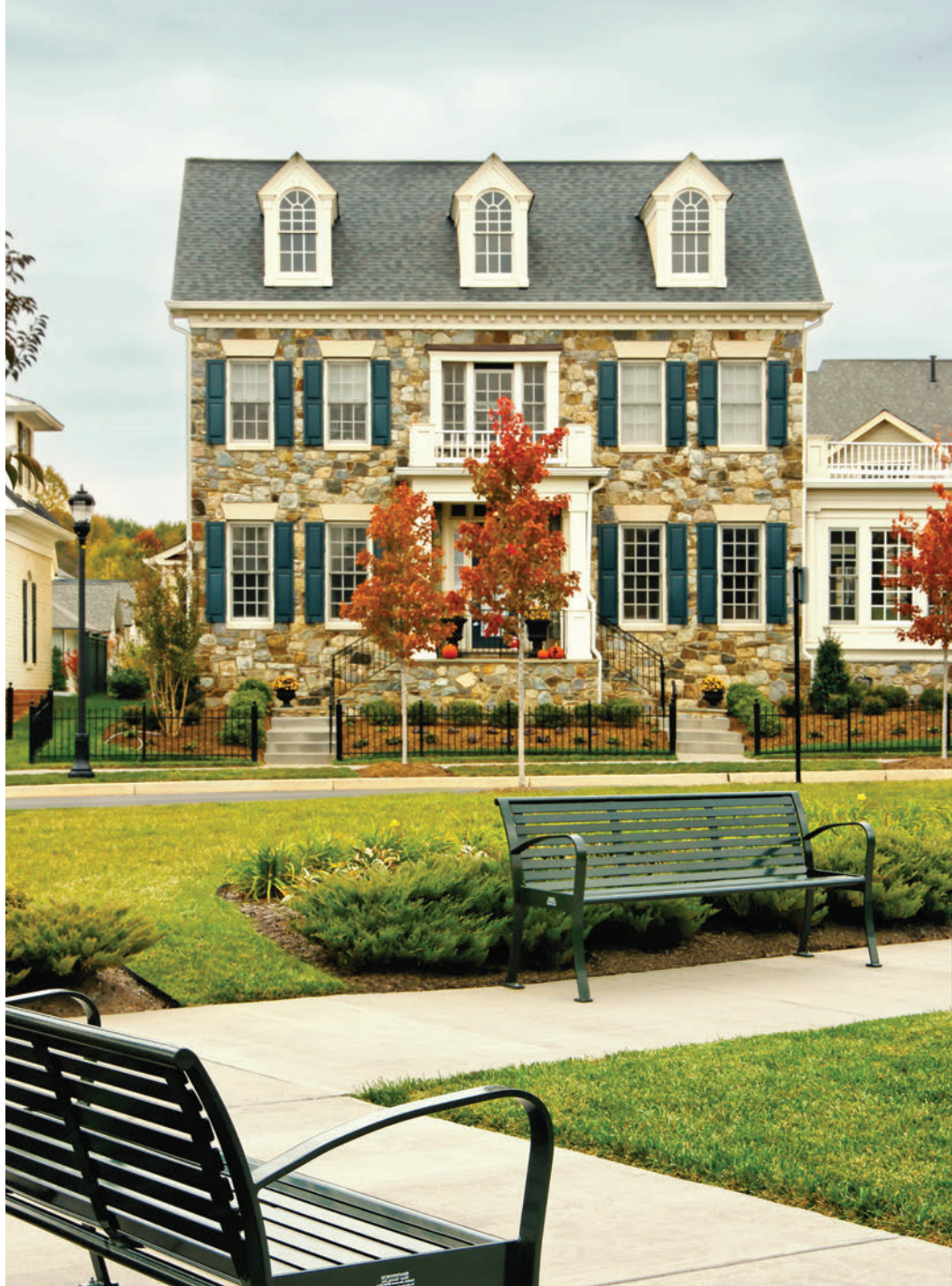
The RBF-28 features smooth lateral lines with welded horizontal steel slats. Maple Lawn, Maryland, USA.