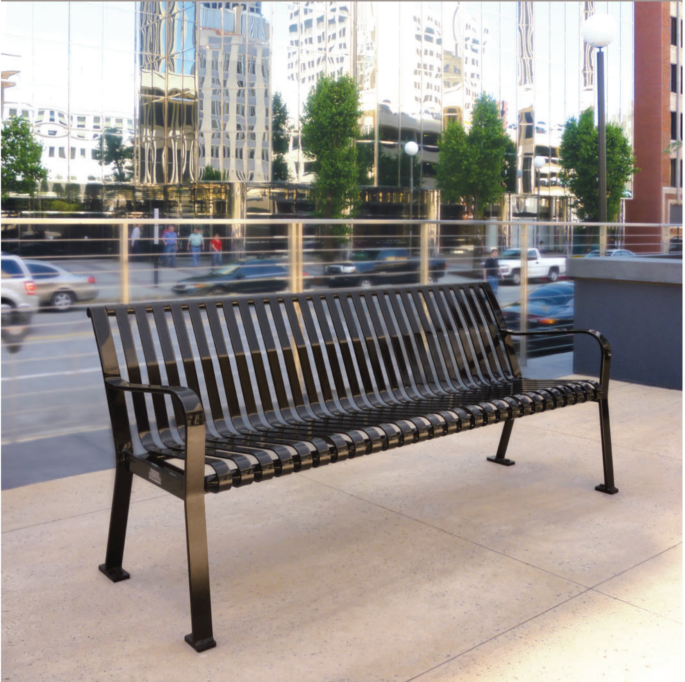
RB-28. Oklahoma City, Oklahoma, USA.

Furniture-Quality Finish Joints: The beautiful RB-28 is one of our most popular products. Carefully fabricated and expertly hand polished, the RB-28 combines elegance and comfort with strength and durability.