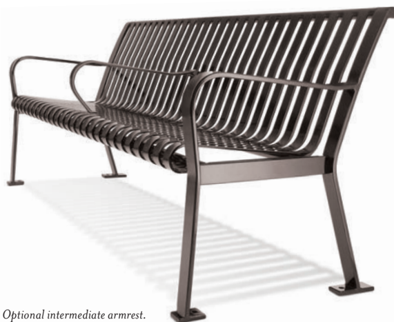
RB-28. Optional intermediate armrest.