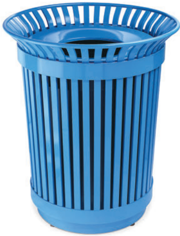
Our patented, tapered RB-36 features a top horizontal steel band...ideal for decals.