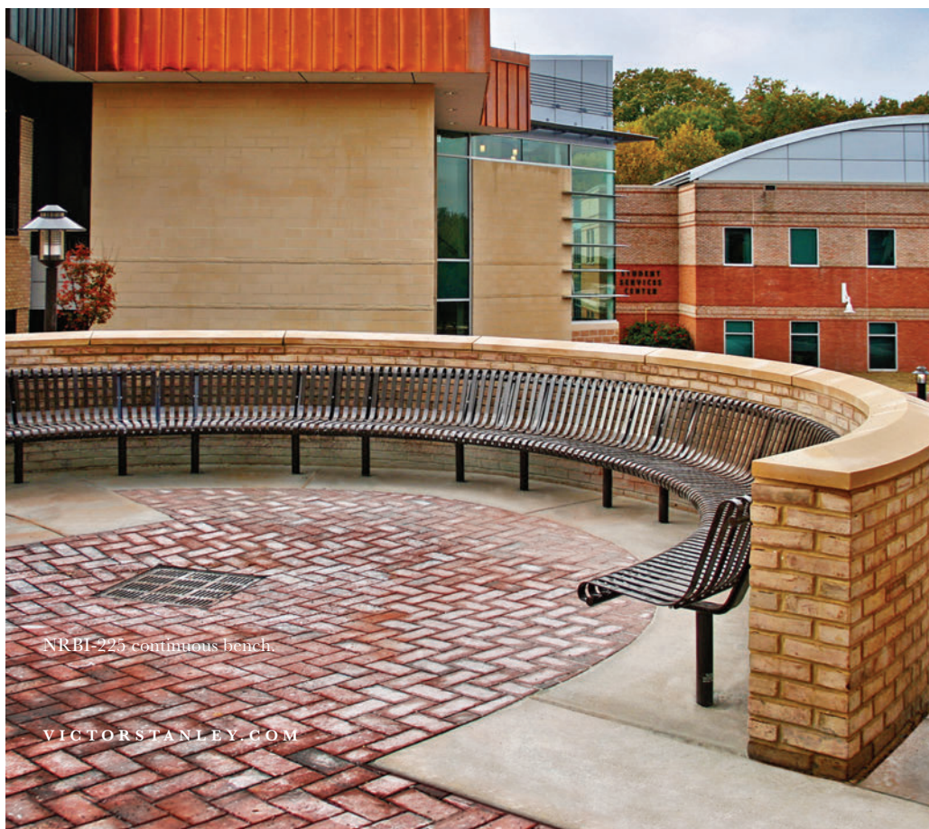
NRBI-225 continuous bench.