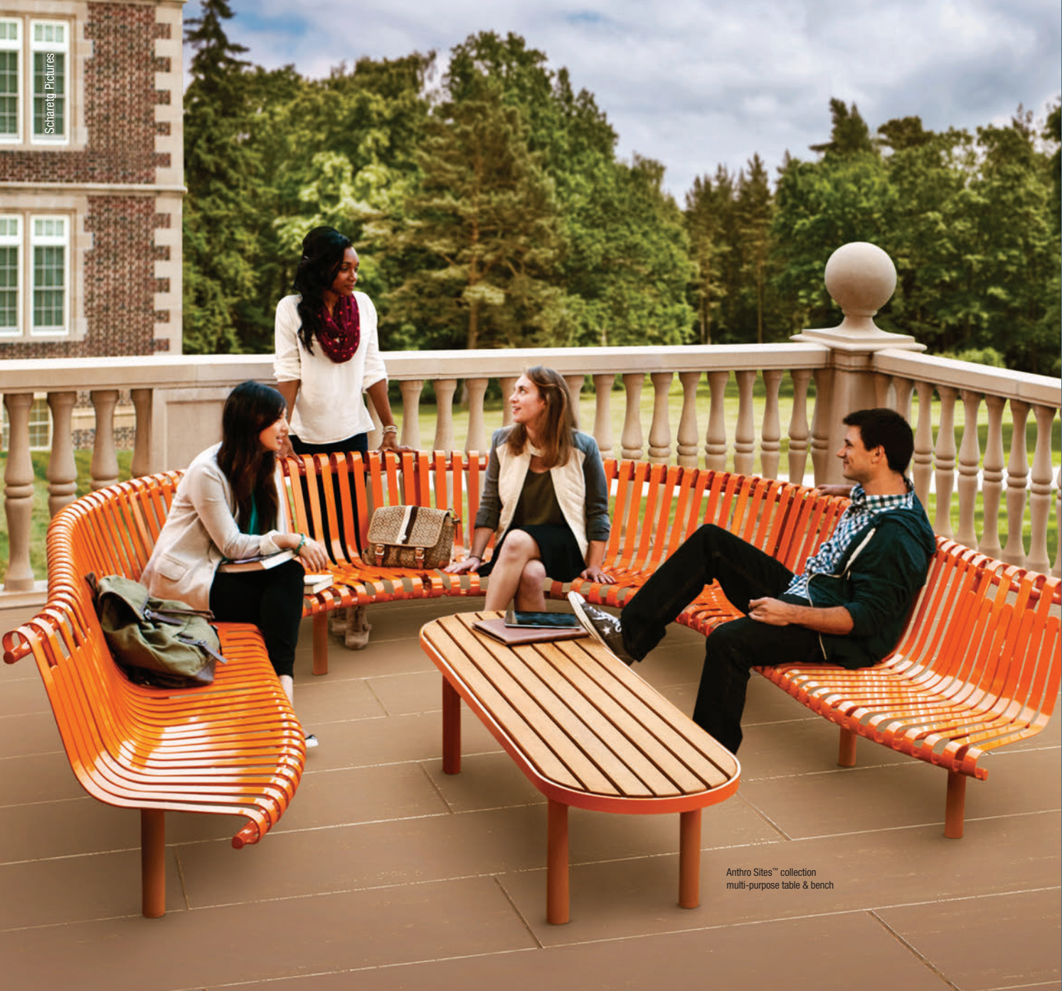
Anthro Sites™ collection multi-purpose table & bench

Turning courtyards into lecture halls since 1962.