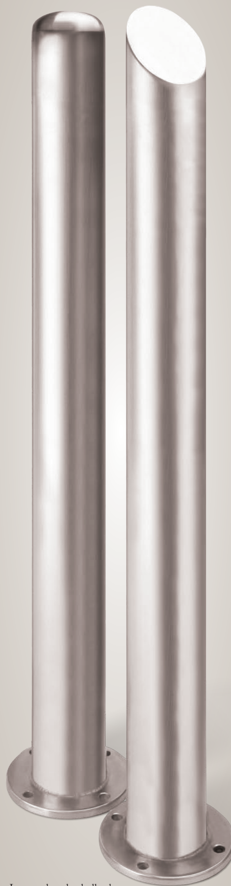
Lens and wedge bollards. Surface mount.