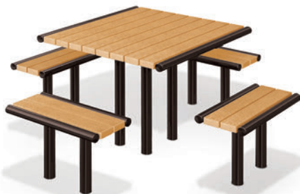
F-4. In-ground mount.*

OPTIONS: Recycled plastic slats (see CM-4, CM-3, CM-2 page 84-85). Surface mount. In-ground mount. Gameboard. Skateboard guards, US Patent D647,729 S.