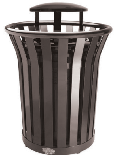
T-24. Optional dome lid.