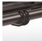
Optional skateboard guard. Patented.