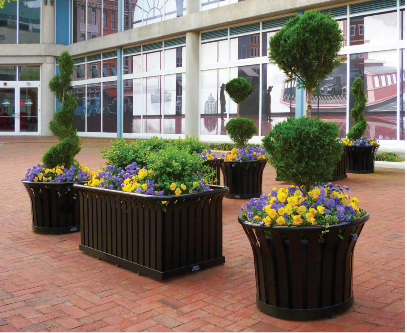
TP-36 round, RST-218 custom rectangular planter. Norfolk, Virginia, USA.