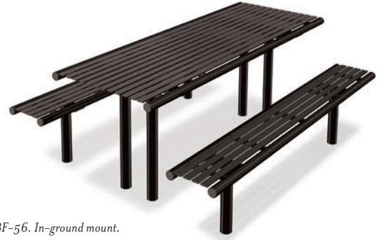
FBF-56. In-ground mount. Patented.