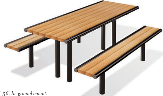
F-56. In-ground mount. Patented.*

♿ ADA Compliance: Pair table in extended 8 ft (2.4 m) length with 6 ft (1.8 m) benches.