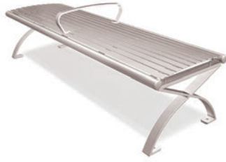
FBF-63. Optional armrest. Patented.