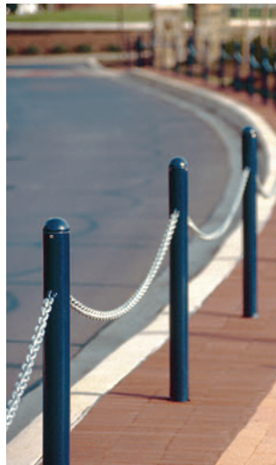
BKR-36. Chain not included.