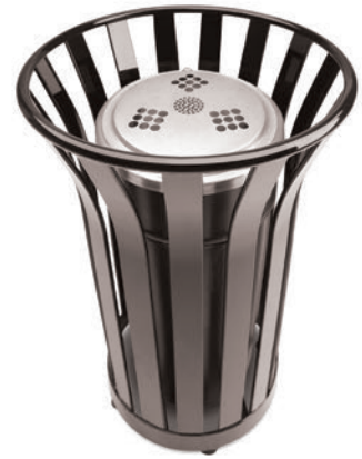
T-6. Optional covered ashtray.