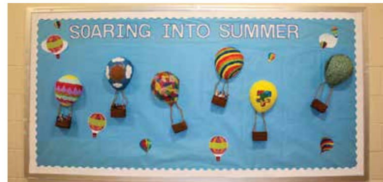
For the students at CLL they are gearing up for summer!