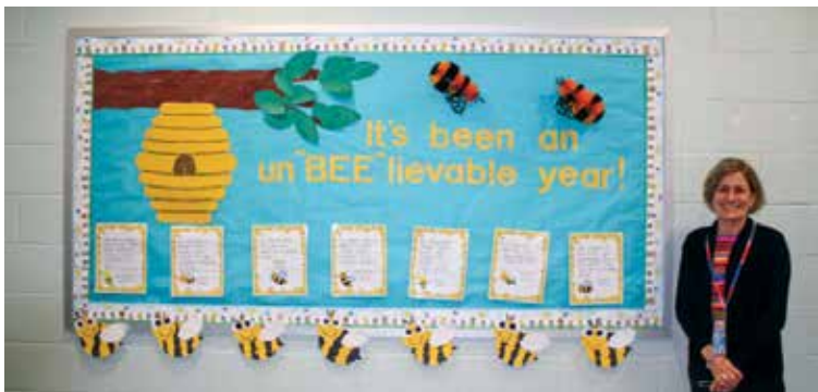
It has been an unbelievable year for the students at BBLC!